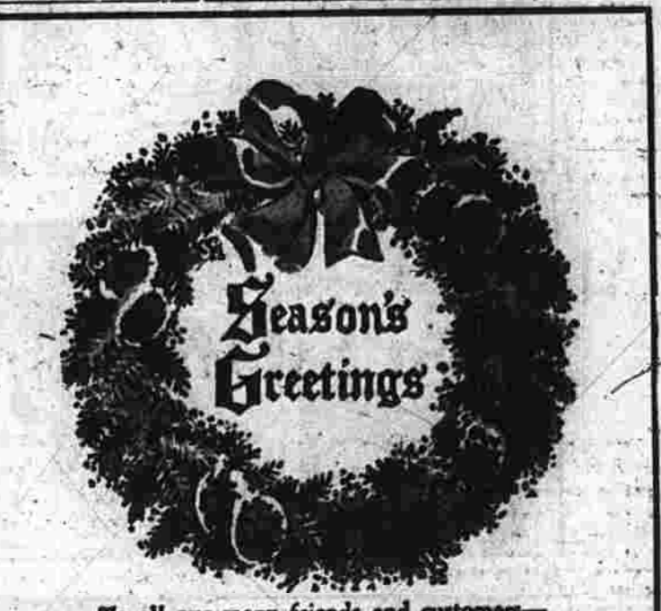
At this joyful season, we take pleasure in extending to you Season's greetings.

CORNELL BAKE SHOP 440 HARTFORD RD.—MANCHESTER