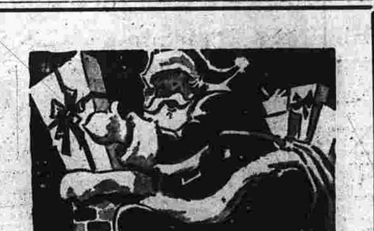
At this joyful season, we take pleasure in extending to you Season's greetings.

CORNELL BAKE SHOP 440 HARTFORD RD.—MANCHESTER