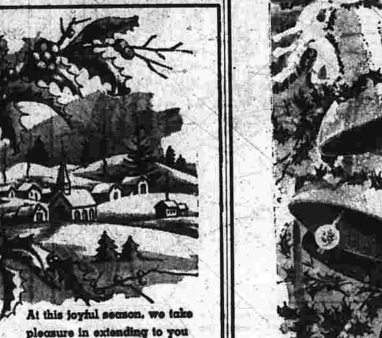
At this joyful season, we take pleasure in extending to you Season's greetings.

CORNELL BAKE SHOP 440 HARTFORD RD.—MANCHESTER