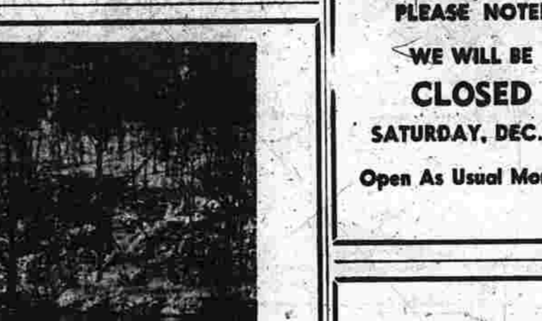
At this joyful season, we take pleasure in extending to you Season's greetings.

CORNELL BAKE SHOP 440 HARTFORD RD.—MANCHESTER