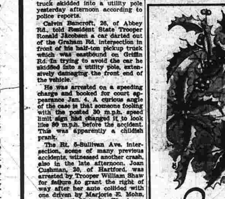
At this joyful season, we take pleasure in extending to you Season's greetings.

OUR SALESROOM AND SHOP WILL BE CLOSED Christmas Day and All Day Saturday, Dec. 26.