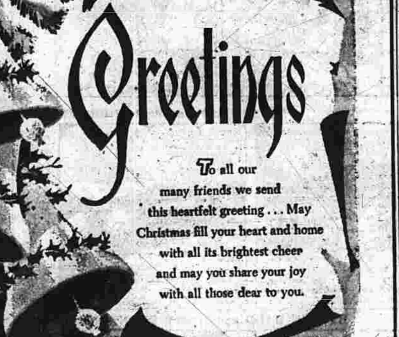
At this joyful season, we take pleasure in extending to you Season's greetings.

CORNELL BAKE SHOP 440 HARTFORD RD.—MANCHESTER