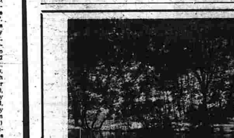
At this joyful season, we take pleasure in extending to you Season's greetings.

CORNELL BAKE SHOP 440 HARTFORD RD.—MANCHESTER